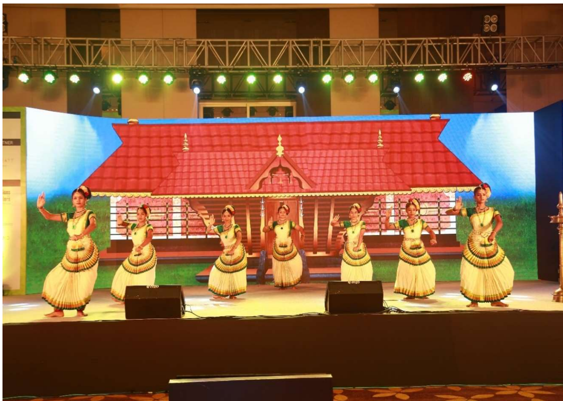
Cultural program at the Inauguration