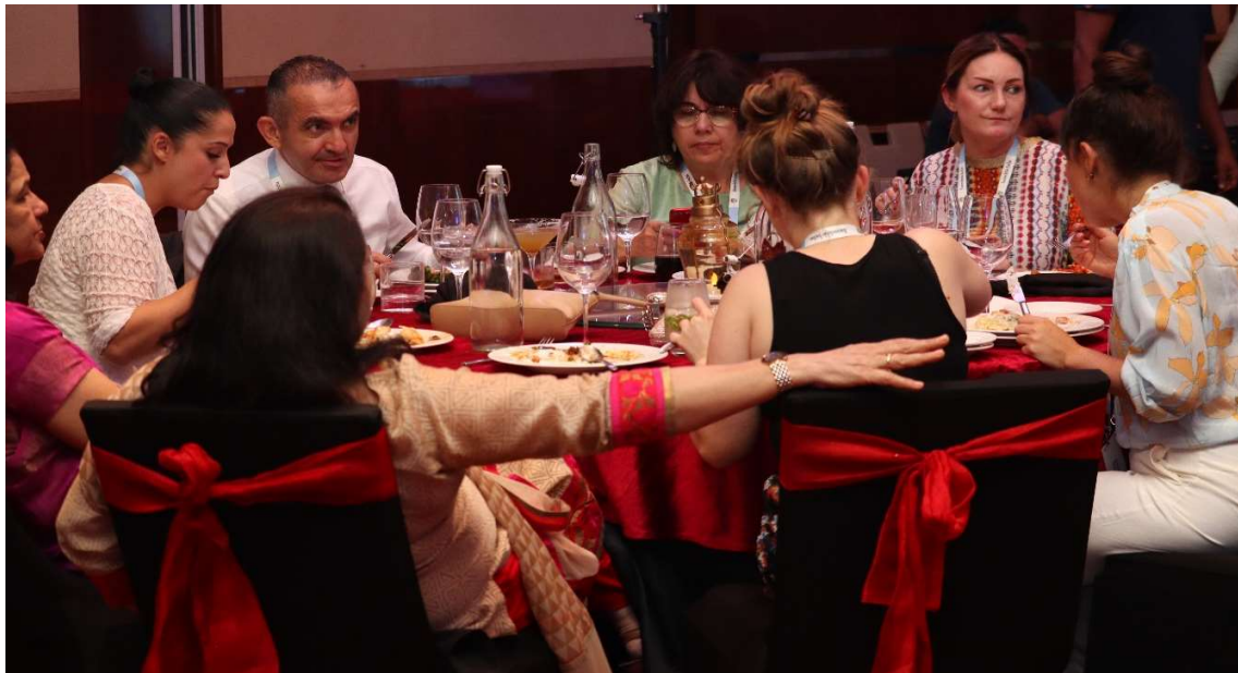
Hotel Marriott, Kochi

Networking dinner hosted by Hotel Marriott, Kochi on 29 th August 2019