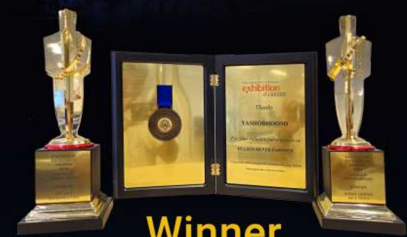
Winner India's Leading Mice Venue & Top MICE Infrastructure Exhibition Excellence Awards 2024