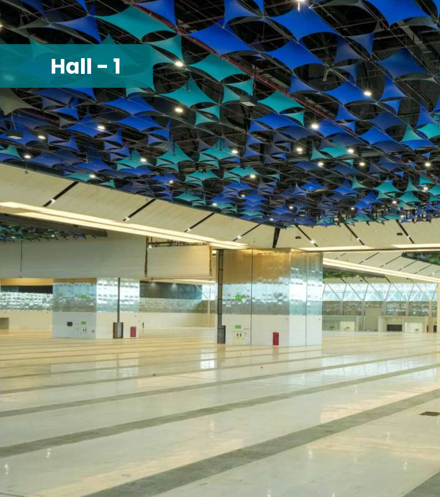
Hall - 1