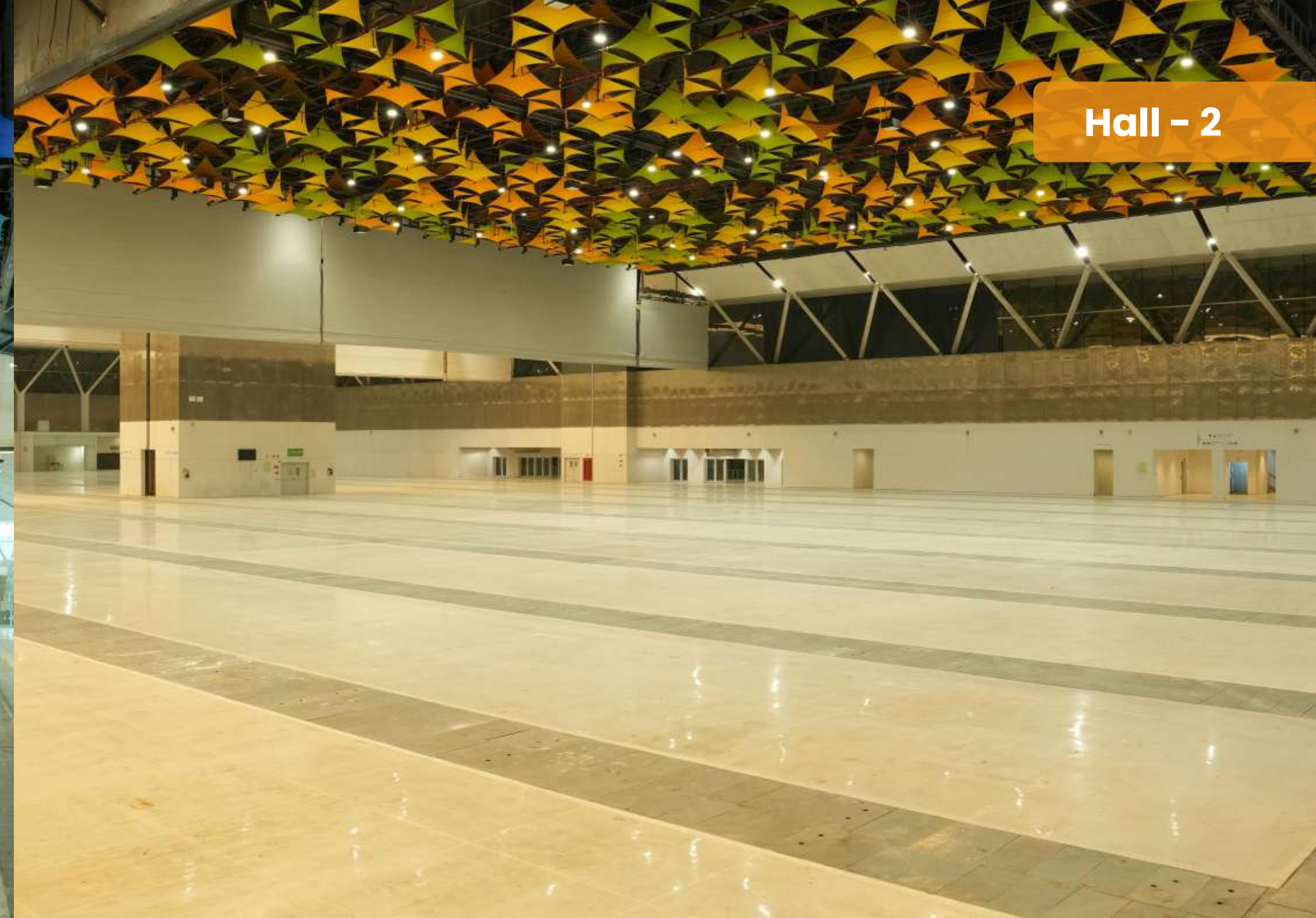
Hall - 2