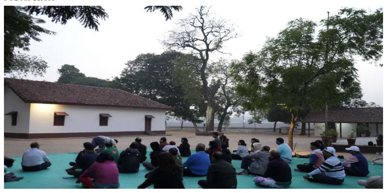
Day 3 dated with Gandhi Darshan & Meditation at Sabarmati Ashram: