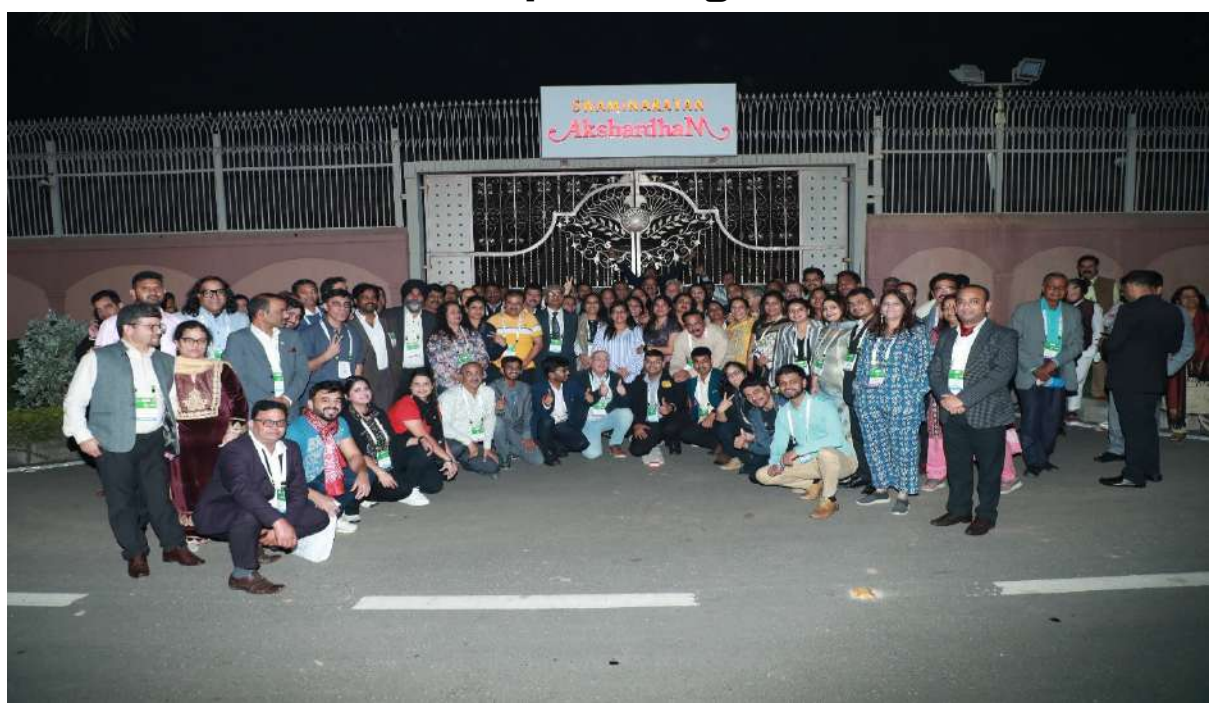
Day concluded with Networking Dinner at Grand Ballroom Leela Hotel, Gandhinagar